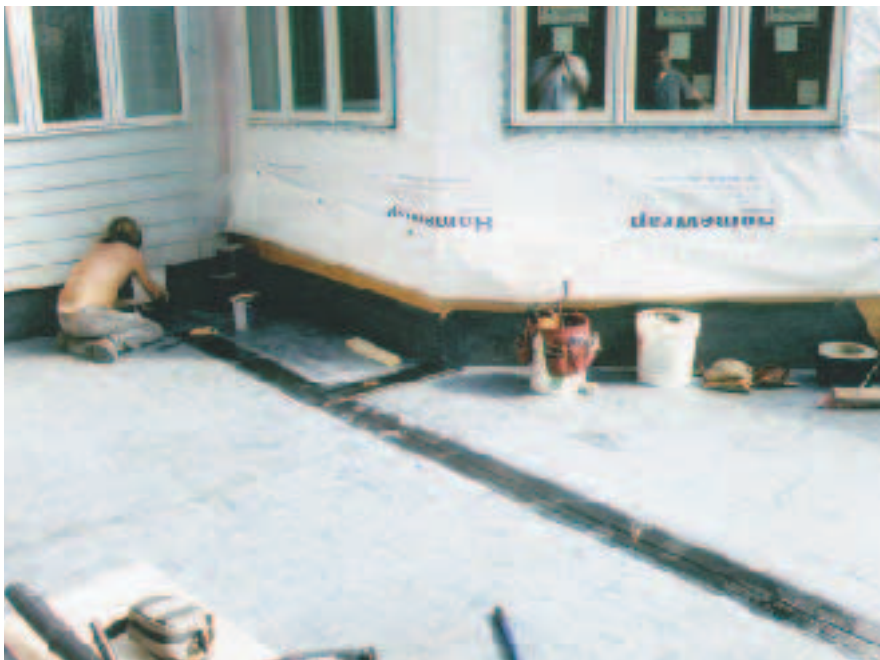
Figure 3. The overlapping seams in an EPDM membrane are treated separately from the main bonding operation. After brushing the seam with primer, the author applies a pressure-sensitive seam tape to secure and seal the edge (top). As a redundant fail-safe measure, the author applies a 6-inch-wide peel-and-stick rubber flashing strip over every seam in the membrane and seals the strip's edges with a lap sealant (above).

double-faced peel-and-stick seam sealer. Jim applies the tape, letting its edge stick out of the seam by about \frac{1}{4} inch to avoid pockets.