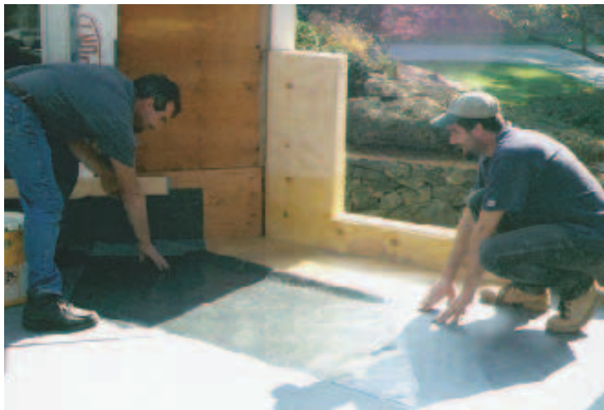
Figure 1. Four hands are better than two to prevent wrinkles and trapped air bubbles in the EPDM bonding process.

Sealing seams. Obviously, tight seams between sheets are critical to leak-proof performance. Every sheet overlaps the previous one by 6 inches, and laps are given a special sealing treatment. The overlapping surfaces must be kept clear of adhesive. After all the sheets have been bonded to the roof, Jim folds each seam edge back and applies Carlisle Sure-Seal Primer to the bonding surfaces (Figure 2, next page). The primer prepares the surface for Carlisle Seam Tape, a 6-inch-wide,