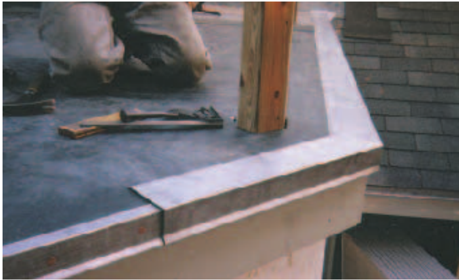
Figure 4. A custom-made two-piece lead-coated copper drip-edge conceals face-driven fasteners. The drip-edge will be sealed to the membrane with a 6-inch-wide rubber cover strip.