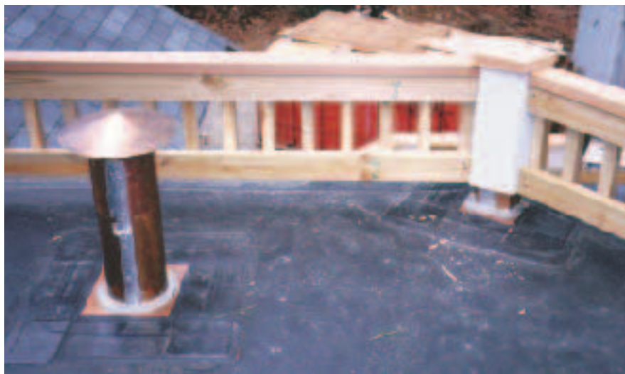
Figure 6. The roofing contractor installed custom flanged copper sleeves over the railing posts and plumbing vent. The flange is bedded in sealant on top of the EPDM membrane, then tightly covered under peel-and-stick rubber flashing strips.

The finished deck rests on pressure-treated 2x6 sleepers, taper-cut to compensate for the 1/8-inch slope and bring the surface back to level. To protect the membrane from wear, we glued 1 1/2-inch strips of rubber, cut from a product called Walkway roof pads, to the bottom edge of the sleepers. These 2x2-foot pads have a pattern of rounded knobs molded into the underside to allow water to