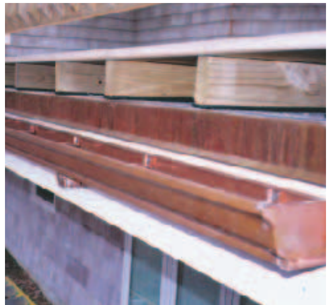
Figure 5. A soldered copper drip pan, nailed on top of the membrane, is sealed under a self-sticking rubber flashing strip. A pliable self-sticking uncured rubber patch seals the junction of the outside wall corner and deck (left). The drip pan directs runoff into a copper gutter (right).